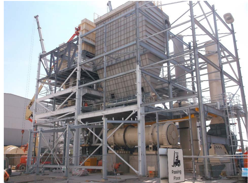
NG Building - June