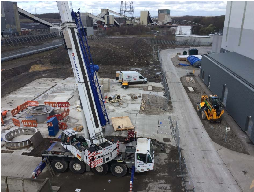
NG Building groundworks - April