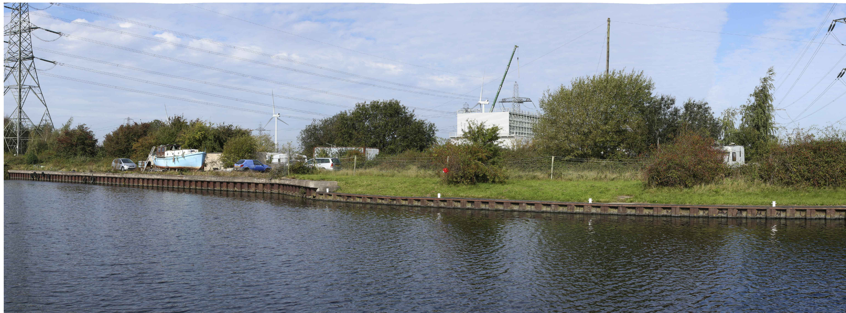
Extent of 50mm single frame image

PROJECT The Keadby 3 (Carbon Capture Equipped Gas Fired Generating Station) Order CLIENT Keadby Generation Ltd