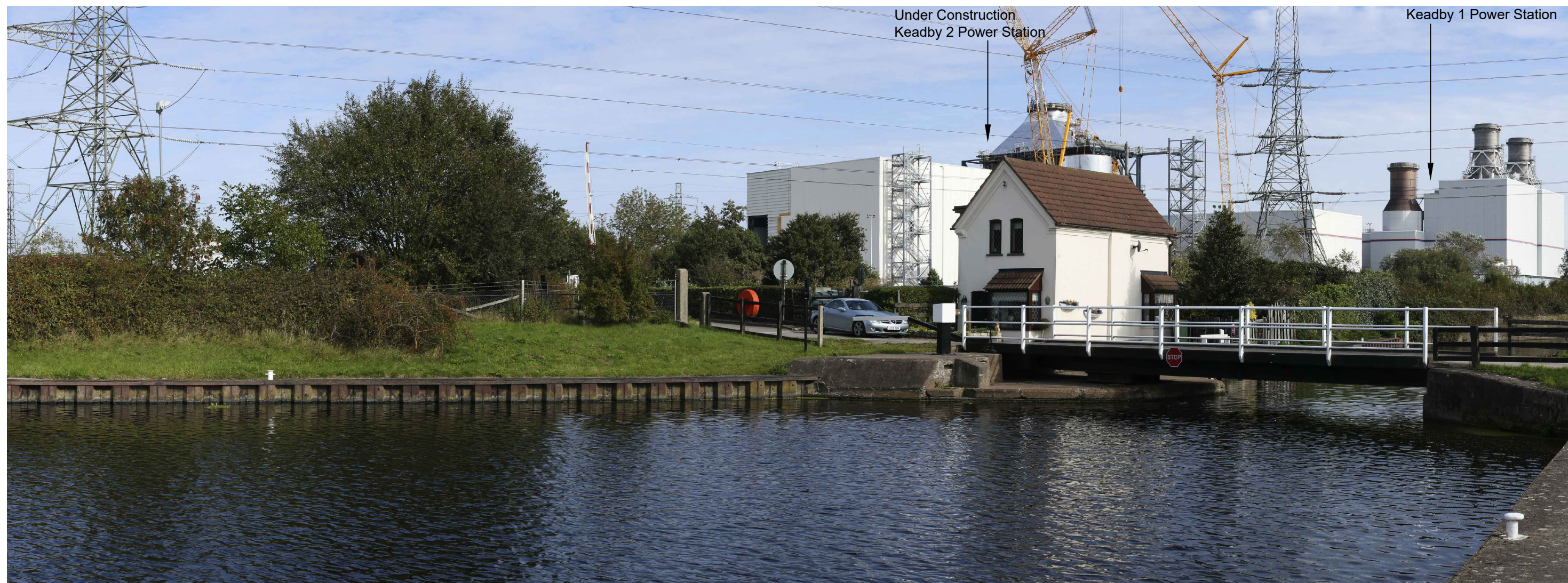
Extent of 50mm single frame image

PROJECT The Keadby 3 (Carbon Capture Equipped Gas Fired Generating Station) Order CLIENT Keadby Generation Ltd