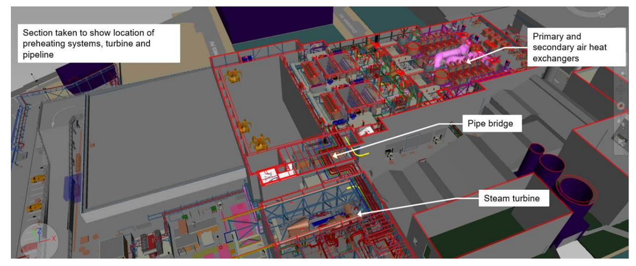
Plate 2.1 – 3D Model Section View of Consented Development with external pipework and pipe supports (Note – Proposed Project external pipework is coloured blue)

2.4.10 The design and appearance of the proposed material for the external pipe has been driven by engineering requirements and to blend in with the Consented Development building design. The pipe will be constructed from steel, it will have a 50mm thick insulation layer with an Aluzinc / aluminium zinc alloy cladding. The overall diameter will be 373mm in total.