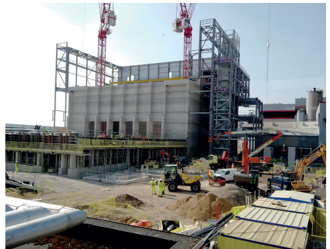
The Slough Multifuel project currently under construction

This consultation is our final stage of consultation (our Stage 2 Consultation) and will run to 17 June 2022. We are planning to submit our application for a DCO to the SoS during Q3 2022.