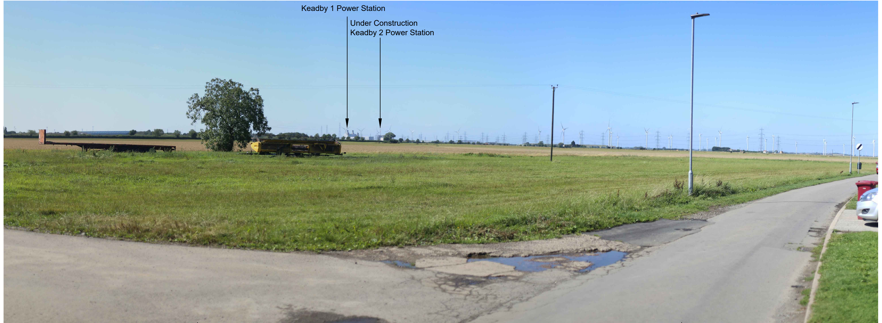
Extent of 50mm single frame image

Project Management Initials: SE Designer: RL Checked: RC Approved: NW Last saved by: BECCALI.LT.L (2021.05.07) Last Printed: 2021.05.12 Filename: N:\UK\DIS2\PPF\3\01\01\PROJECT\3\VIEWPOINTS\LANDSCAPE AND VISUAL\FIGURES\KADBY VIEWPOINT 10\VIEWPOINT 10032.DWG