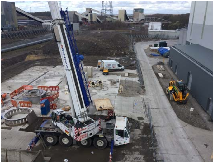
NG Building groundworks