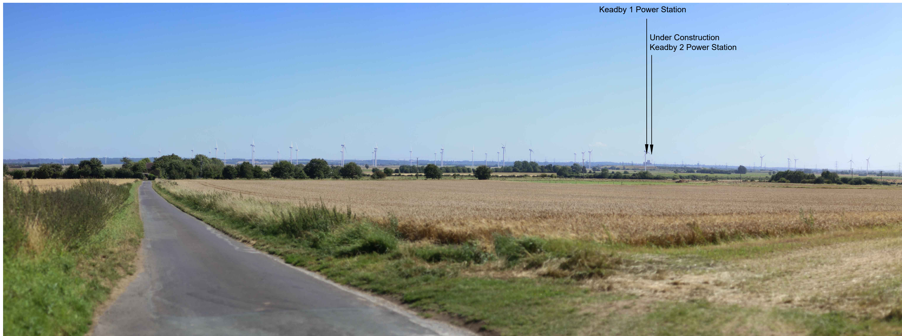
Extent of 50mm single frame image

Project Management Initials: SE Designer: RL Checked: RC Approved: NW Last saved by: BECCA LITTLE (2021-05-07) Last Plotted: 2021-05-12 Filename: \\UKLDS2\PPS\W001\1E_PROJECT\NEWPROJ\1E_60625943 - SSE KEADBY AND MEDWAY DCOV02 SSE KEADBY05 TECHNICAL DISCIPLINES\13 LANDSCAPE AND VISUAL\FIGURES\KEADBY VIEWPOINT FIGURE\PHOTOVIEWPOINT 060625943.DWG